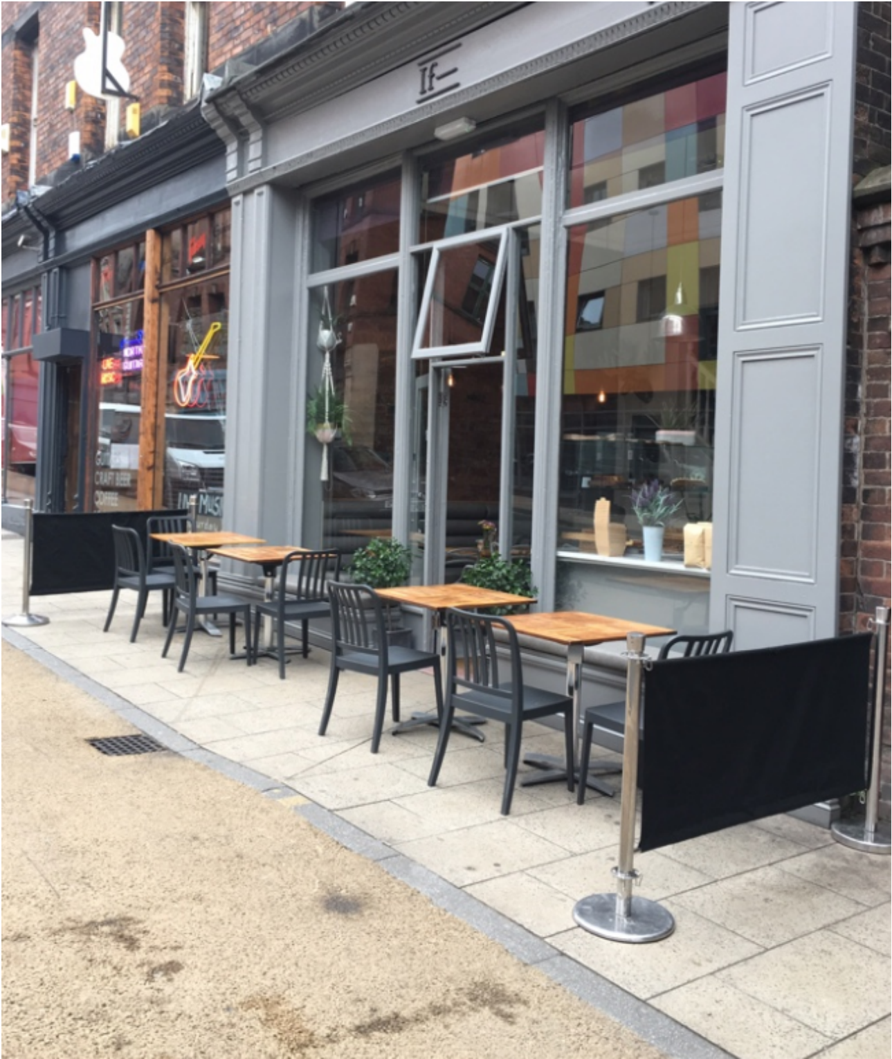
Seating placed out to show area when placed.